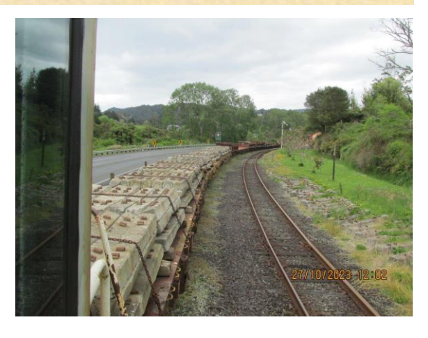
Been a while since Waikino Station has seen a train of this length.